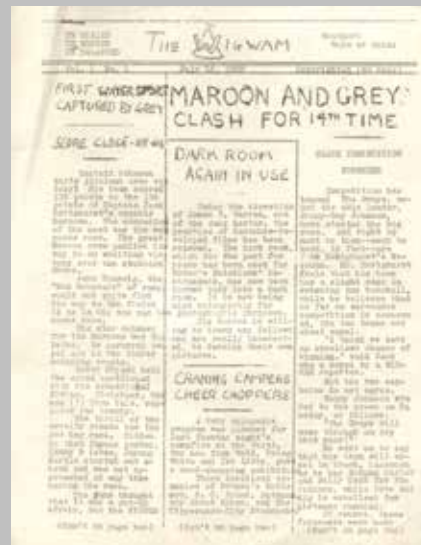
The First Wigwam was published on July 12, 1935